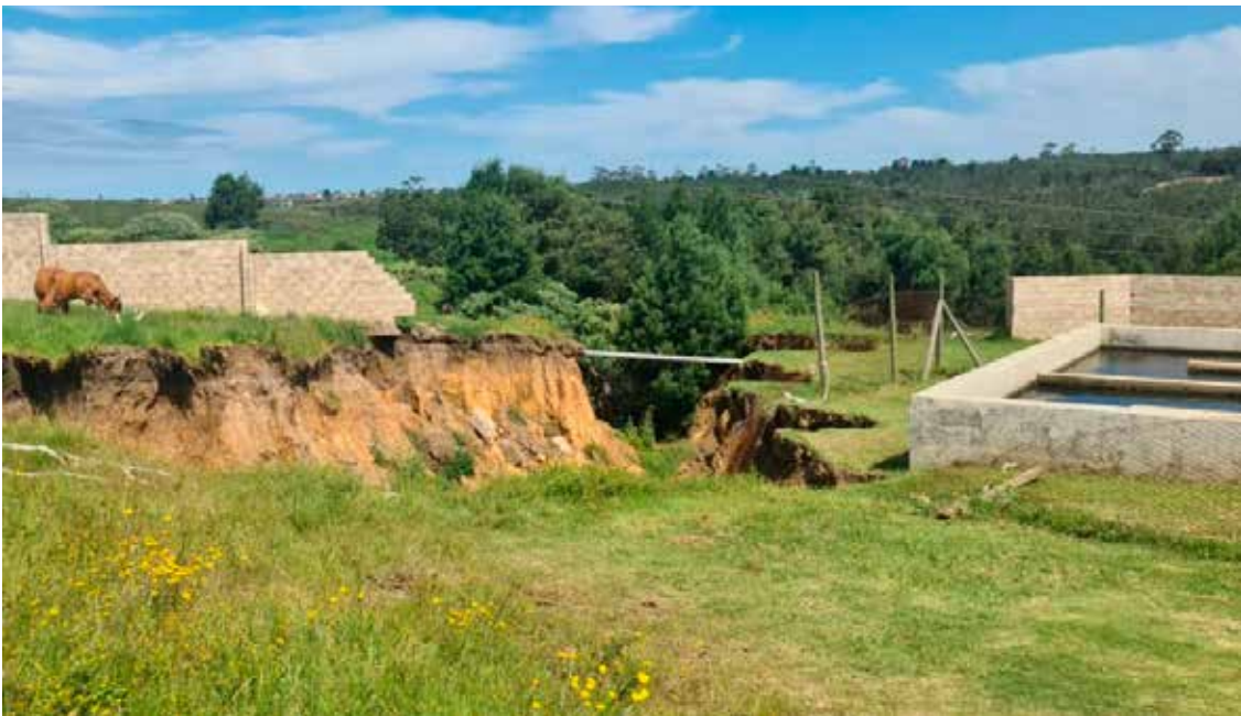
The Gwaiing donga before the remedial works.