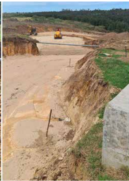
The danga prior to the remedial works and how it currently looks with the remedial works under way. The suspended steel pipe is an existing cable sleeve and the rehabilitation is being done with the sleeve and cable intact.