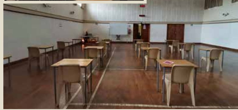
Die Uniondale gemeenskap-saal word ingerig as 'n lokaal vir leerlinglisensie-klasse. INLAS: Die oogtoetsmasjien is reeds ingerig by die Uniondale bestuurders-lisensie-toetssentrum.