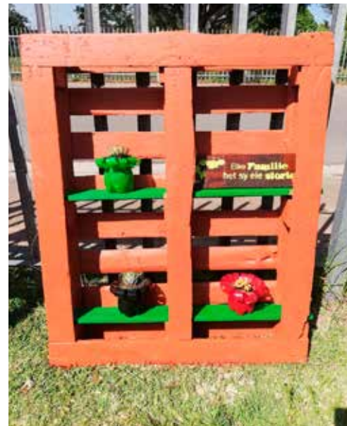
Finished products that will be sold at the market days.

This resulted in a showcase of materials at a modelling show recently held in New Dawn Park, Pacaltsdorp. The PCBA have assisted them to set up a stall at their Community Market Days where they will sell some of their upcycled stuff. The group intends to work hard and connect with like-minded organisations, to make and be the change in their community.