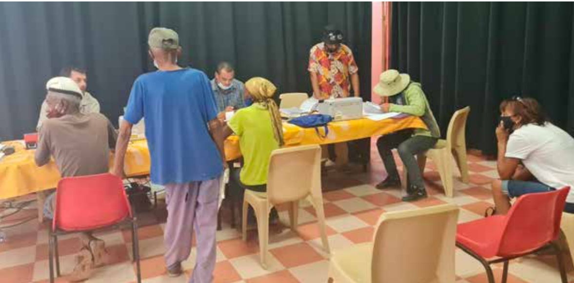
Mense van Uniondale daag op by die Mini-jamboree by Lyonville gemeenskapsaal. Amptenare van die departement van Maatskaplike Dienste help mense van Haarlem met navrae.