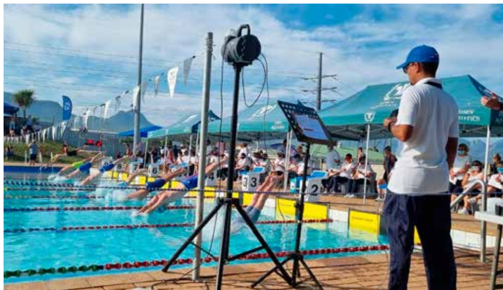
Conville Swimming Pool, a proud host of the SA Regional Level 3 Swimming Gala with 350 participants from all over the Western Cape.