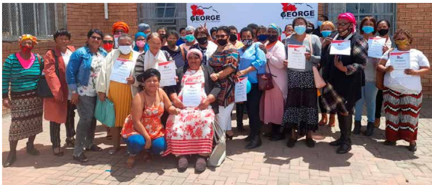
The representatives from the 125 Nutritional Centres across George attended an Appreciation Service at Lawaaiikamp Community Hall. Here they are proudly showing off their appreciation certificates for a job well done.