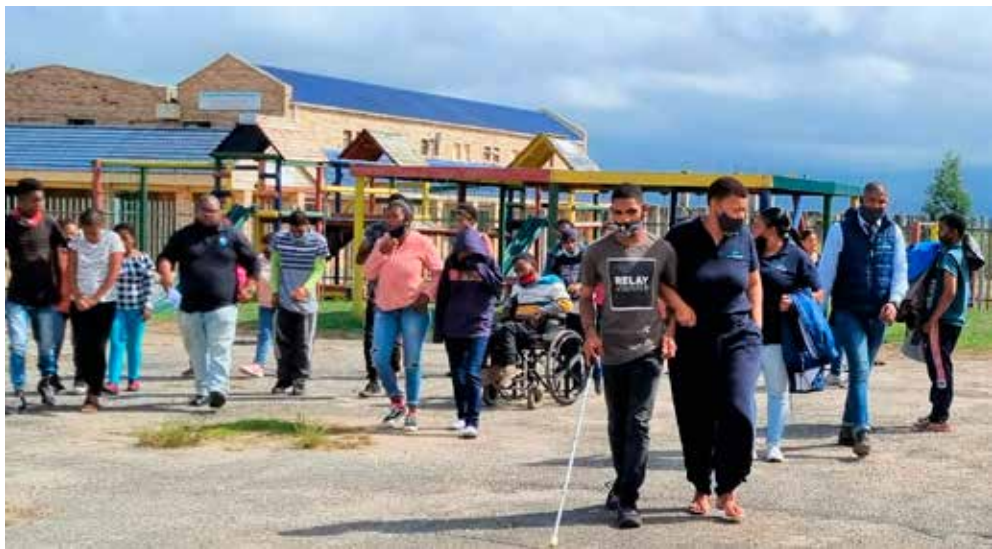
Die groep vertrek in vrolike luim by die Optima-sentrum met die meer ervare passasiers baie gretig om hul "verhewe" kennis te deel.