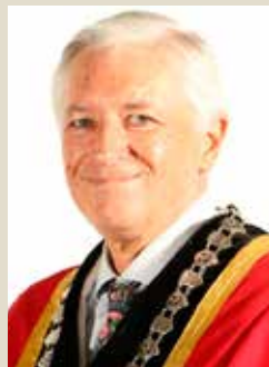
Ald Leon Van Wyk Executive Mayor PR (DA)