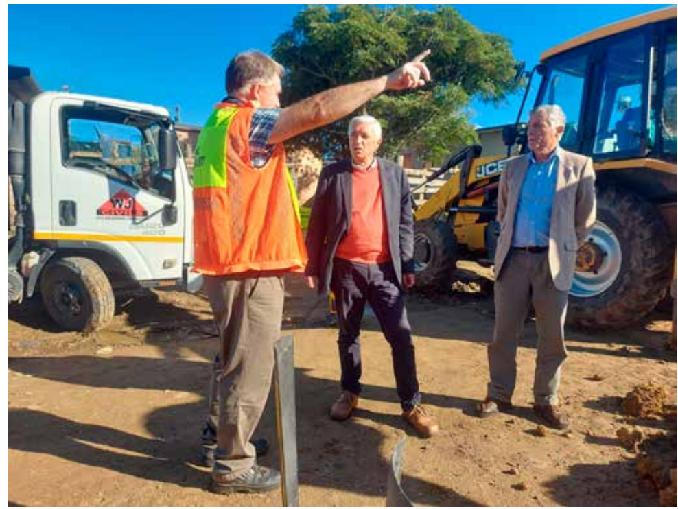
The existing stormwater infrastructure in the vicinity of Mbewu, Spetose and Dick Streets is radically structured with an upgrade that will be followed by the paving of several streets.