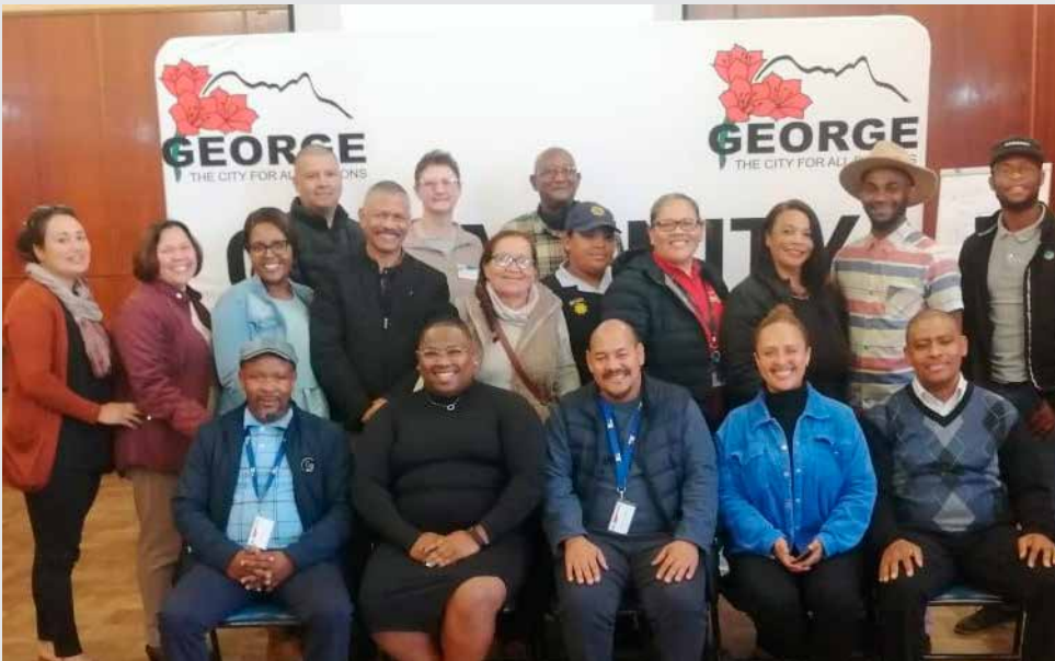
Members from the different stakeholders that form part of the Local Drug Action Committee at the training session.