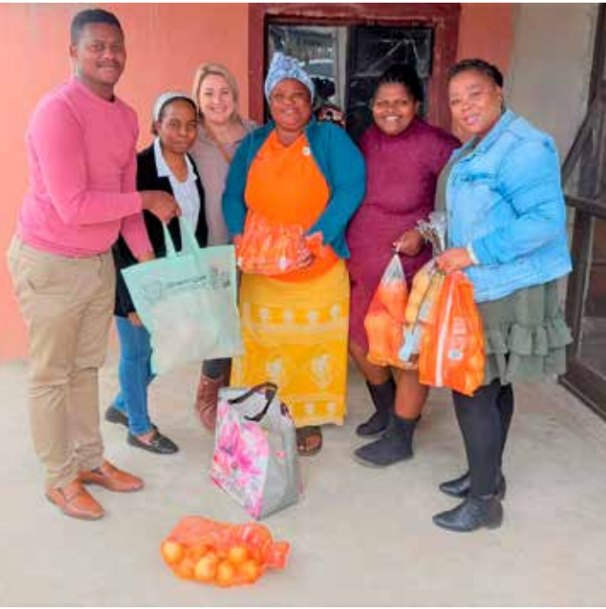
Building Control and Planning officials donate soup parcels in Rosemore.

Officials in Uniondale representing all of the directorates in George, jointly organized a soup drive for children and adults in the community as well as a paint drive to update refuse bins and a clean-up in the community.