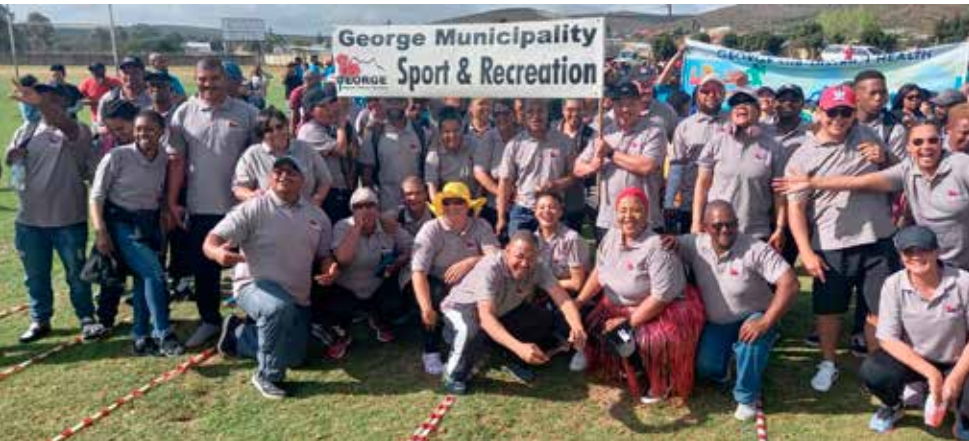
George team returns triumphant from Riversdale.

"We are thrilled to hear that you went out there and represented George Municipality. Congratulations to the officials who attained Gold and to our netball team who reached the final. Well done to all competitors. You have made us proud!" The Garden Route Sport and Recreation Day is an annual sports event that is hosted by Sport and Recreation Services of the Western Cape Department of Cultural Affairs and Sport involving government officials in the various districts of the province as well as in the metropole to try their hand at soccer, mini-cricket, volleyball, tug of war, chess, athletics, and many other codes.