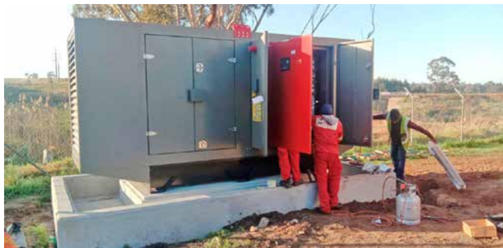
Installing a 300kVA backup generator at one of the sewer pumpstations.

built over the next 15 years," said Ald Van Wyk.