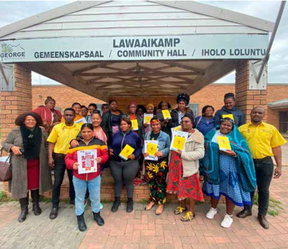
Representatives from the various creches and the facilitators from Working on Fire at the venue.