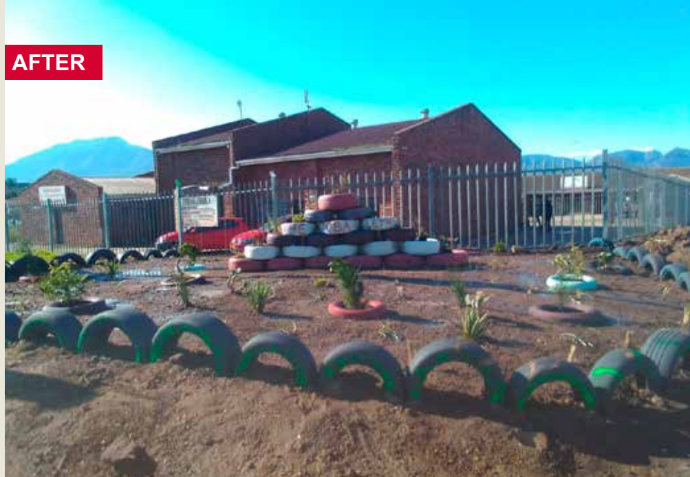
After: The community beautified the spot by creating a garden.