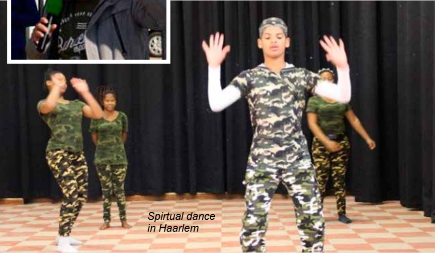
Spiritual dance in Haarlem