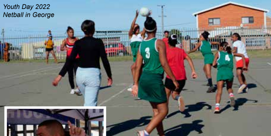
Youth Day 2022 Netball in George