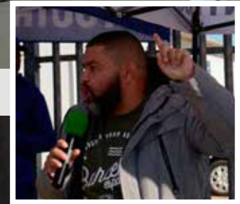
LEFT: Executive Deputy Mayor Raybin Figland