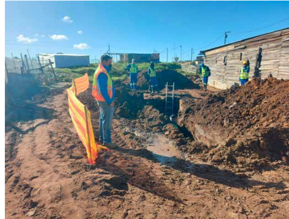
The works being carried out in these streets will ensure quality service delivery to all who live in them.