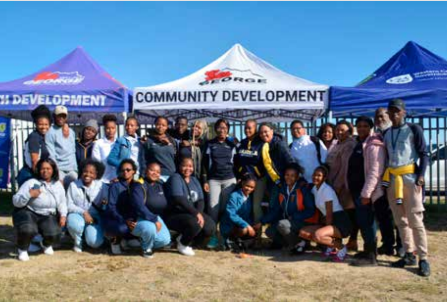
Youth Day 2022 in George

The Programs consisted of motivational speakers, rap, poetry, spiritual dance, modelling, and indigenous games. The women in Uniondale started the day with a march against drug abuse supported by different stakeholders and community members.