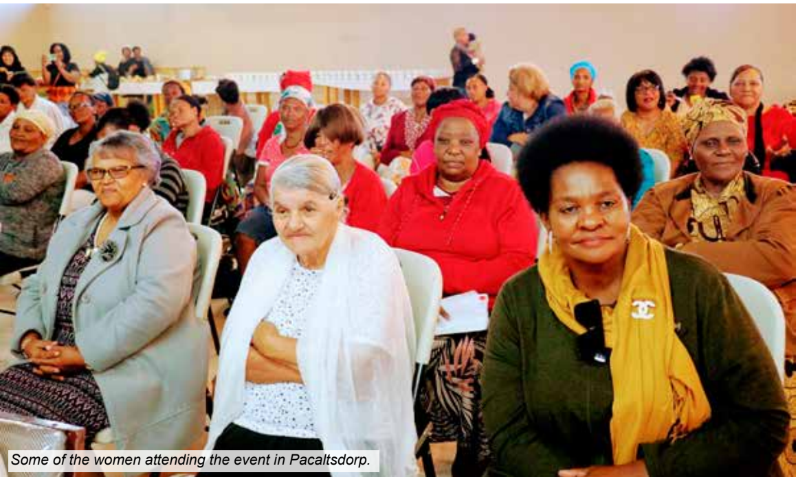
Some of the women attending the event in Pacaltsdorp.