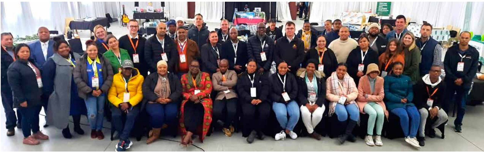
Attendees of the Youth Summit that focused on economic funding and mentorship opportunities.