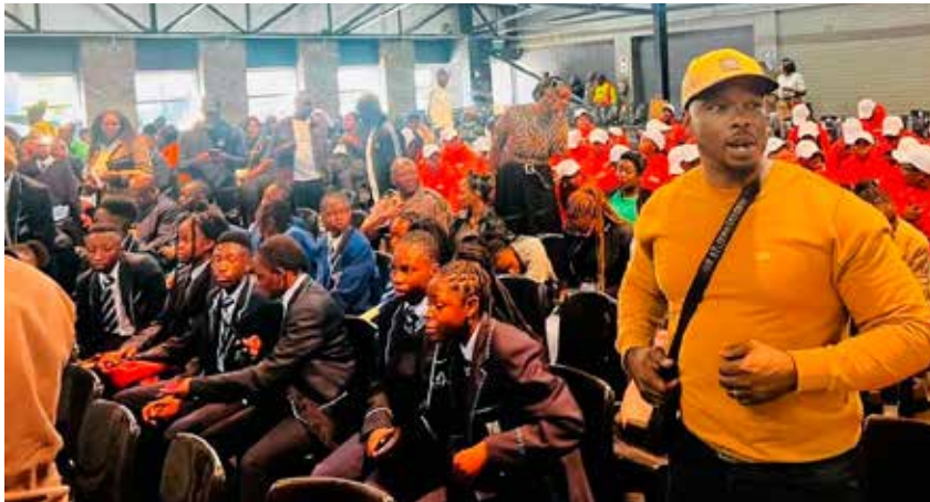
Funda Mzantsi Championship is a whole vibe; the different book clubs have their own 'war cries' and sings and dances to the crowd's delight.