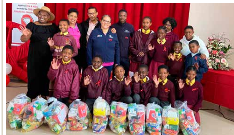
Officials and members from the public and representatives from Tyholora Primary School with hampers that were issued to vulnerable families.

The event was held at the Lawaakamp Community Hall with members from the community who assist people affected by HIV/Aids or people who have directly been affected by the virus. Teachers and learners from Tyholora Primary School were also invited to the event as part of the community outreach.