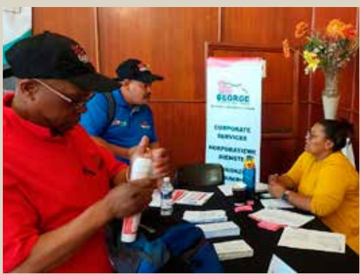
Officials from Civil Engineering Services assisting the Ward Committee Members at the IDP Open Day.

One of the standout features of George Municipality's approach to IDP feedback sessions is its recognition of the importance of projects that may not fall within its direct purview but are instead the responsibility of national or provincial departments. The