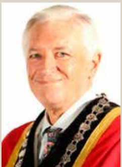
Ald Leon Van Wyk, Executive Mayor PR (DA)