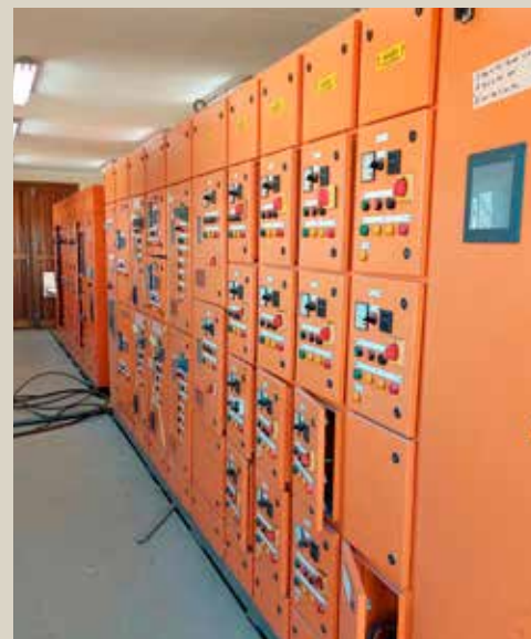
New Motor Control panel to control new equipment at plant.

He said a master plan for the Gwaiing Wastewater Treatment Works is in process to plan for the incremental expansion of the works to meet the medium term (28MI/day) and long term (50MI/day) requirements. This allows the Municipality to plan and budget timeously as demand increases. It is anticipated that the next phase of the upgrading of the works will commence in 2024/25, subject to funding availability.