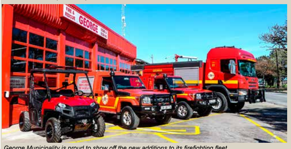
George Municipality is proud to show off the new additions to its firefighting fleet.