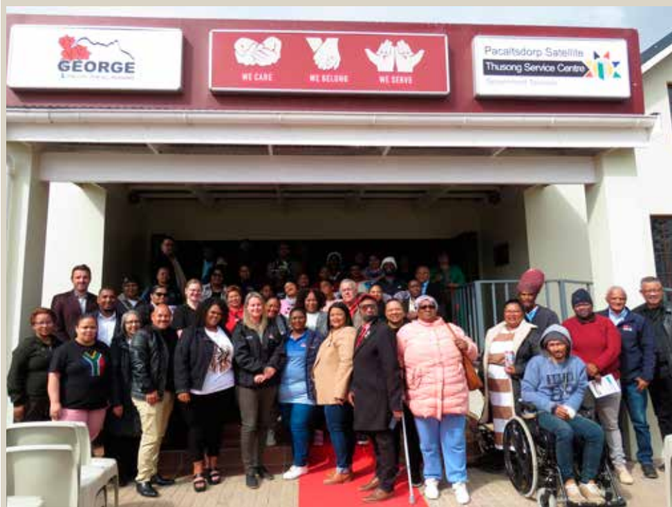
Councillors, stakeholders and community at the opening of the Pacaltsdorp Thusong Centre.

residents to access vital government information and services. The establishment of this facility was identified as a key priority in the Municipality's Integrated Development Plan (IDP) to address the community's pressing needs. The maintenance of the Pacaltsdorp centre is supported by a grant from the Western Cape Department of Local Government. With this addition, the George Municipality now has three Thusong Centres (Themba lethu and Touwsrante) significantly enhancing service coverage across the community. The launch coincided with the Annual Thusong Service Centre Week from September 16 to 20, which emphasizes the critical role these centres play in improving community access to services. Mayor von Brandis thanked all officials involved in the project and urged residents to protect the centre, affirming, "It belongs to you as much as it belongs to us."