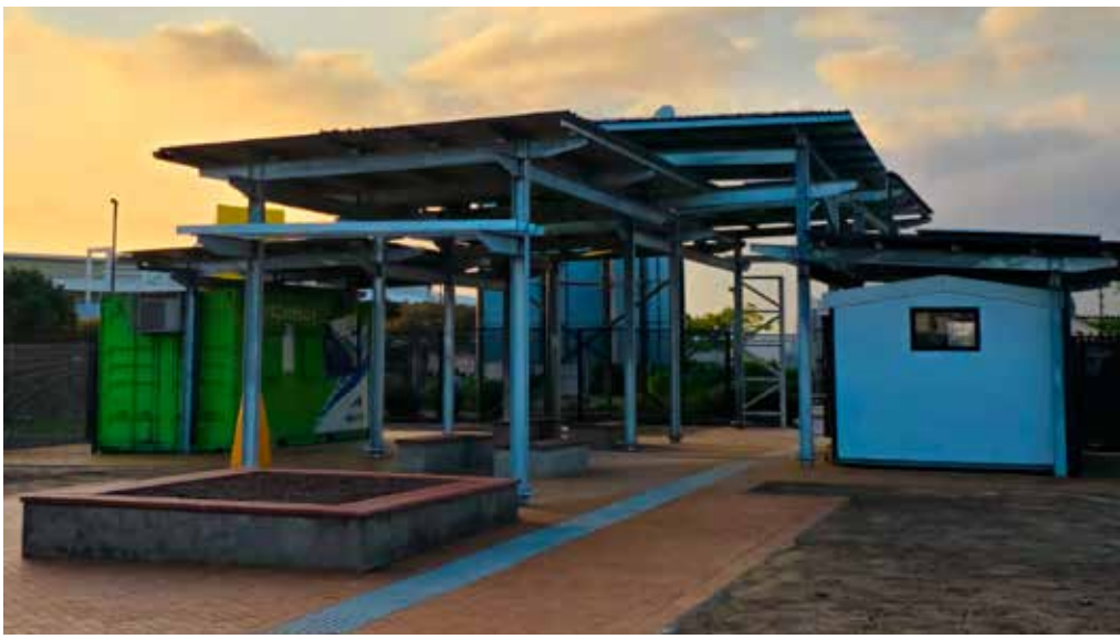
The development of the transfer precinct at the Garden Route Mall offers a sheltered terminal facility with seating, and six shelters at bus stops. The existing smart card kiosk was integrated into the design.