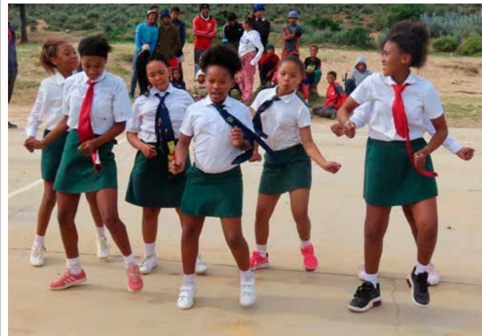
The Uniondale Junior dance group entertaining the youngsters at the event.