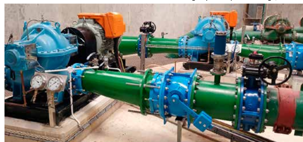
WTW New Clean Water Pumps

Status: The project construction contract was awarded for an amount of R 106,5 million February 2023. Construction commenced on site in April 2024. Construction progress is currently at 41%. The estimated completion date for the project is June 2025.