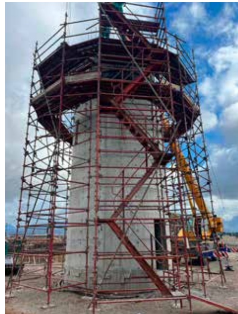
Thembaletu East Tower shaft

Two 1250 kVA generators have been installed at the Garden Route Dam raw water pumpstation. These generators are ensuring that during any other power outage, raw