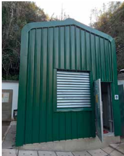
Kaaimans River Pumpstation

Phase 1: The first phase of the upgrading and refurbishment of the Meul Sewage Pumpstation was completed in June 2023, which inter-alia included a new standby generator and motor control centre. This