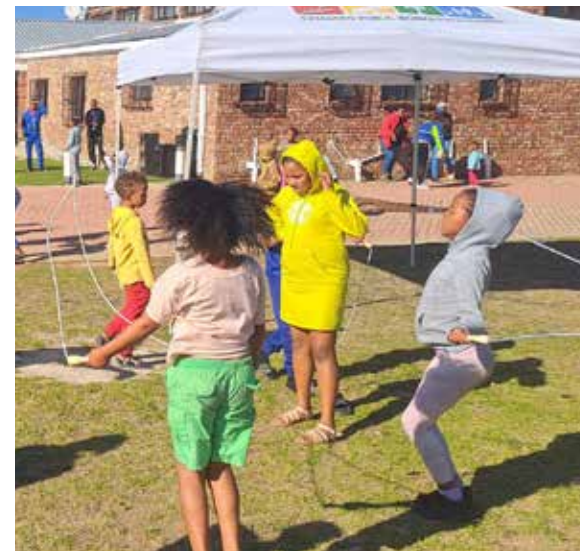
Games at Haarlem Youth Day event.