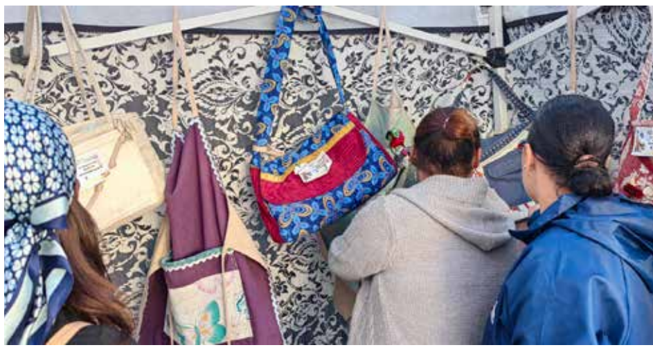
George Municipality’s local sewing group, S&D Creations, is being supported by local George businesses including This is Me, Bleu Forest Books, West Coast Fisheries and Tastebuds Eatery.