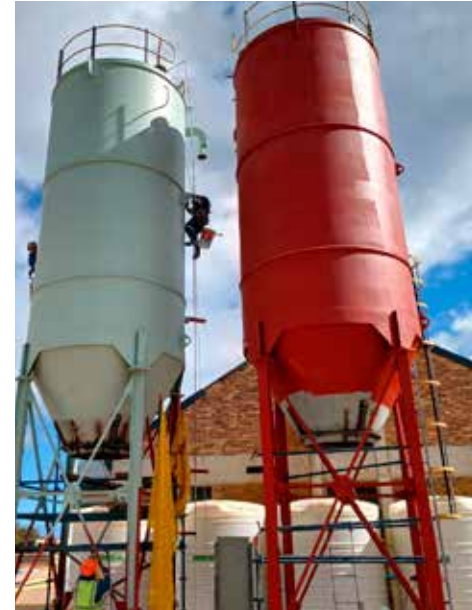
20 Mld WTW Chemicals Silos

The new 14,5 Mℓ Pacaltsdorp West Reservoir and Pumpstation will address