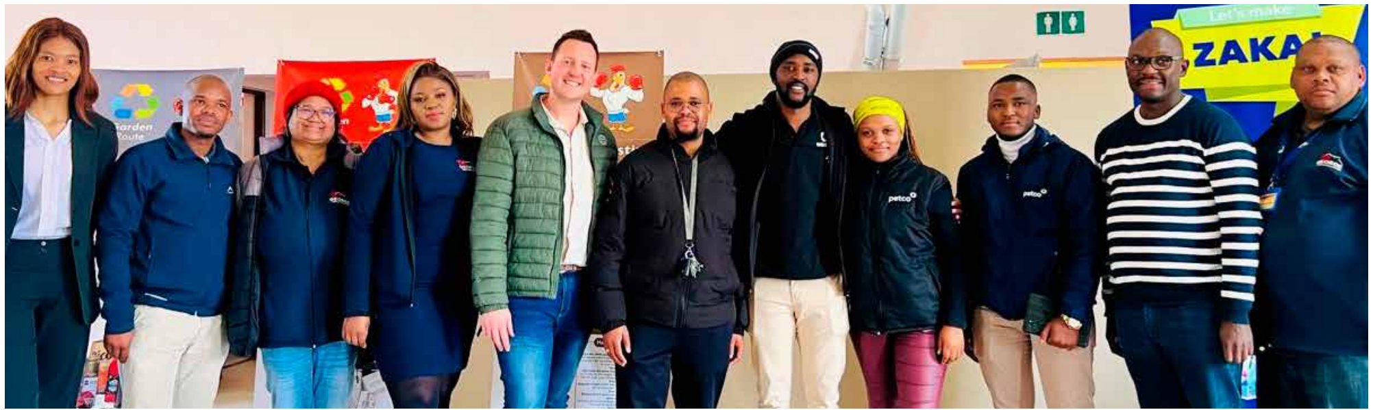
George Municipality Celebrates National Recycling Day with Key Stakeholders.