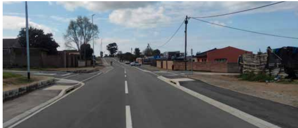
Rehabilitation and upgrading of Golf Street in Parkdene were completed recently. Pedestrian safety and universal accessibility are important features of the project.

Municipal road upgrades are continuously