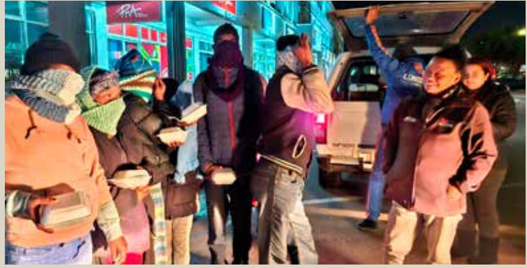
Winter Soup Outreach.

Reunification Since July 2024, Project Hope has reunited six individuals with their families. The organisation also provided counselling services to two people and made eleven referrals to external support organisations. With its comprehensive approach, including the employment of peer educators and ongoing support programmes, Project Hope remains committed to reducing homelessness and offering long-term solutions for vulnerable residents in George.