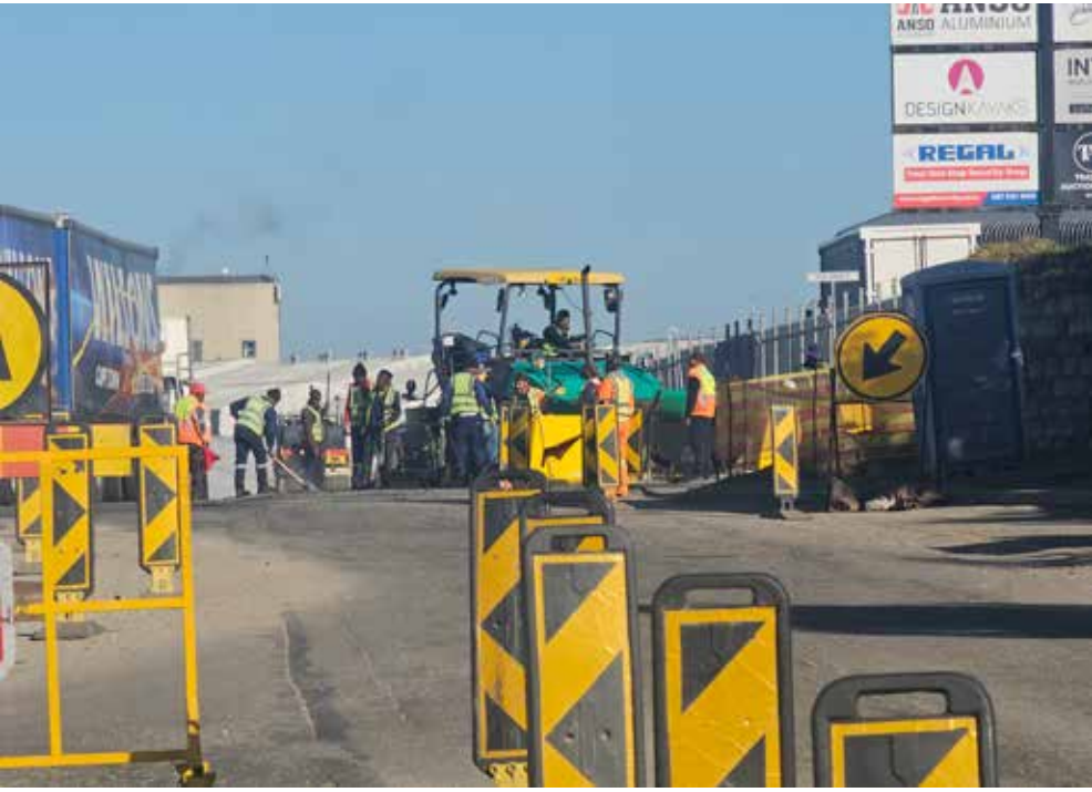
PW Botha Boulevard, Asphalt paving.