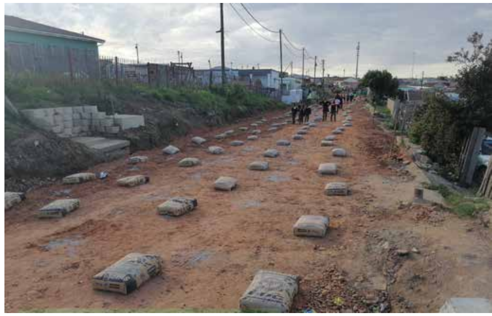
Tabata Street stabilization.