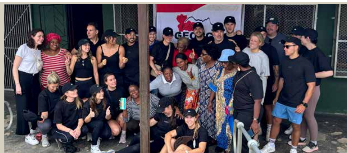
Representatives from iSprout and teachers from Isiseko Crèche.