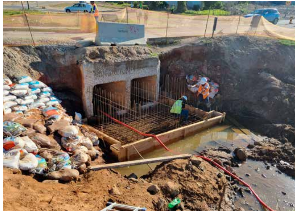
Rose Street, Culvert.