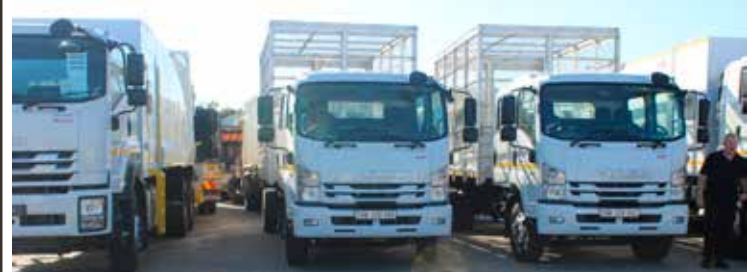
The brand new refuse compactor trucks and cage trucks delivered.

He further commended officials for their efforts, saying: "I want to acknowledge the Environmental Services teams for their hard work and commitment. Together, we are building a municipality that prioritises service delivery, environmental responsibility, and community well-being."