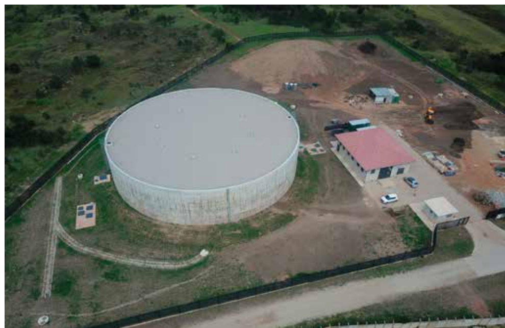
Pacaltsdorp West 14.5 ML Reservoir and Pumpstation.