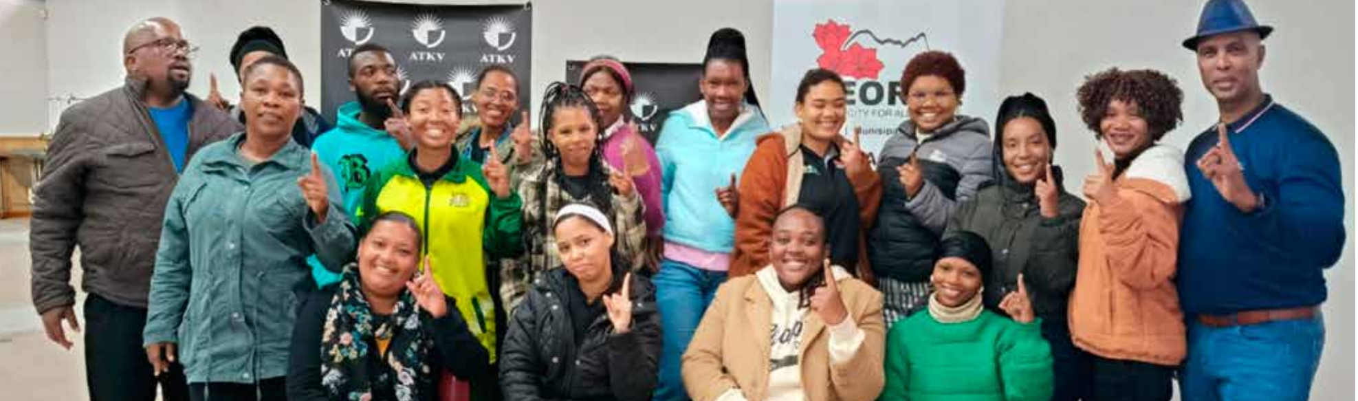
Some of the youngsters and coordinators at the training sessions to give reading facilitators and peer educators practical workplace skills.