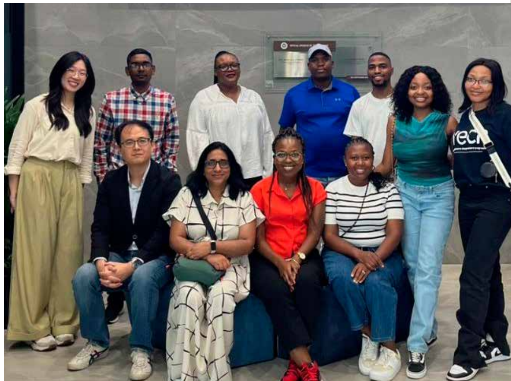
Delegates from the Water Research Commission Young Engineers Changemakers Programme during their visit to TÜV SÜD in Singapore.