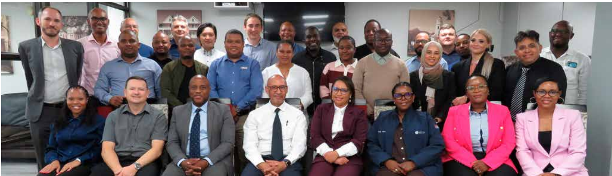
Senior management representatives of George Municipality engage with delegates from National Treasury, Department of Cooperative Governance and Traditional Affairs (CoGTA), the Development Bank of Southern Africa (DBSA), and the Western Cape Provincial Treasury at the George Municipal Council Chambers. The session formed part of the 2025/26 Mid-Year Budget and Performance Assessment programme focusing on municipal financial health, governance, infrastructure implementation, service delivery performance, and preparations for the 2026/27 municipal budget process.