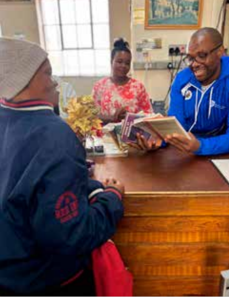
Minister Ricardo MacKenzie gesels met een van die Uniondale biblioteek se lede.

te skep, veral in landelike gebiede. Volgens hom help biblioteke om kennis te versprei en mense toegang tot inligting en leergeleenthede te gee. "Die Uniondale Biblioteek, wat reeds 130 jaar oud is, bly 'n bron van trots vir die gemeenskap. Die biblioteek beskik ook oor spesiale toerusting wat persone met siggestremdhede help om toegang tot boeke en leesmateriaal te kry. Ongeveer 15 siggestremde lede vorm deel van die biblioteek se klubgeskiedenis - 'n bewys dat die biblioteek 'n inklusiewe ruimte vir almal is, het MacKenzie beklemtoon. Inwoners word aangemoedig om hul plaaslike biblioteke te besoek, 'n boek uit te neem en die waardevolle hulpbronne wat beskikbaar is, te benut.