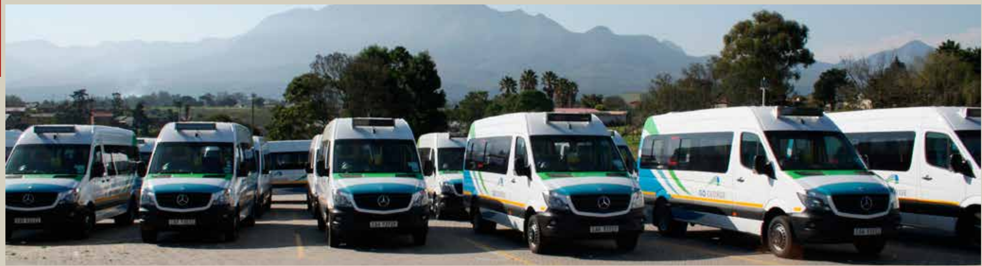
A proud fleet of minibuses against the scenic backdrop of the Outeniqua mountains.