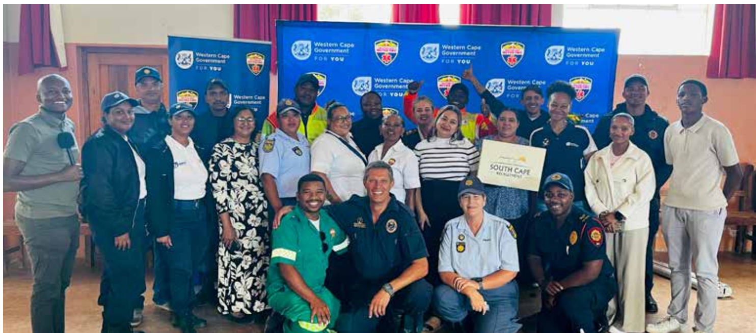
Stakeholders from various sectors who participated in the Mini Career Expo at Franken Primary School.

Stakeholders who participated included representatives from South Cape Nursing College, George Traffic Services, the George Fire Department, George Law Enforcement, the Department of Agriculture, the South African Police Service and its K9 Unit, South Cape Recruitment, and Africa Skills. Their involvement ensured that learners were exposed to a wide range of professions spanning healthcare, public safety, agriculture, recruitment and