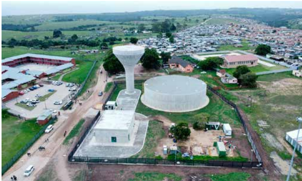
Thembaletu East Water 1ML Tower, 8ML reservoir and Pumpstation.

significant milestone by spending 100% of the R1,115 billion Budget Facility for Infrastructure (BFI) grant by end June 2025 and to date has spent 73% of the Municipality's contribution of R300 million.