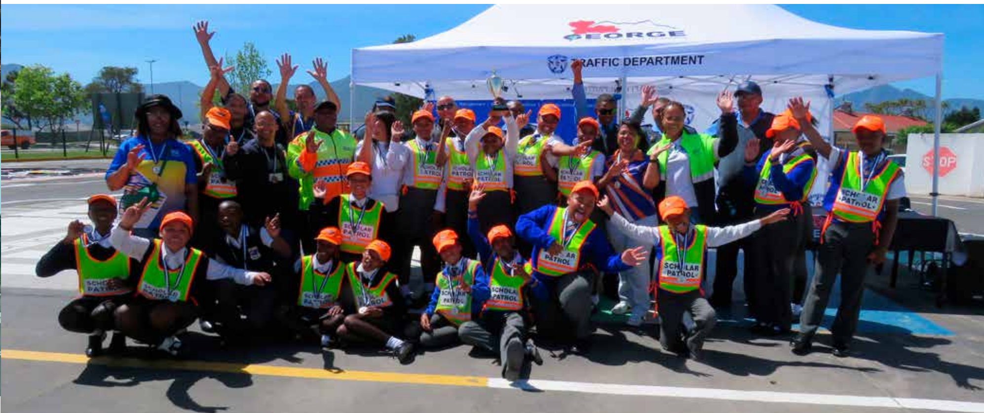
The winners, New Dawn Park, Pacaltsdorp and Conville Primary Schools.

"The knowledge and habits learned through this programme stay with children for life and contribute to safer communities," she said.