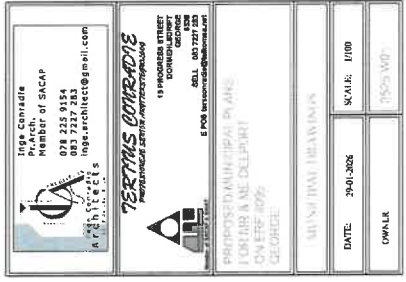
SITE PLAN Scale 1:100

MUNICIPALITY OF GEORGE MUNICIPALITY Approved in terms of Section 60 of the George Municipality: Land Use Planning By-Law (2023) subject to the conditions contained in the covering letter. 05/05/2026 DATE SENIOR MANAGER: TOWN PLANNING SENIOR SUPERVISOR: STATSBEPANNING